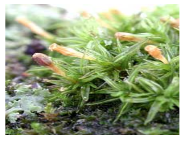
Top view of dry curled leaves of Ulota crispa and bottome closeup view of U. crispa in moist condition.