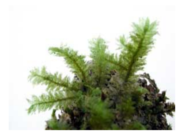
Top view of Neckera pennata showing shelf-like growth of moss away from tree trunk, and bottom view of N. pennata showing wavy appearance of leaves.