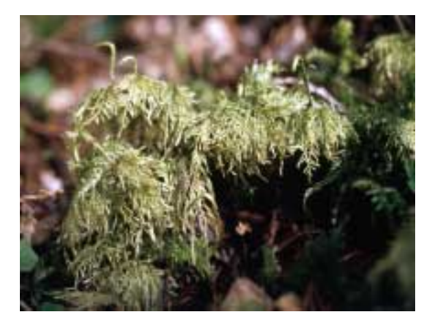
View of Hylocomium splendens showing stair-step growth pattern.

Referred Images—Glime (p. 98); Schofield (p. 171); Vitt and others (p. 107).