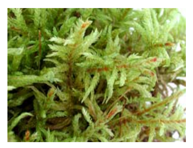
Top view of Pleurozium schreberi showing the feathery growth pattern, and bottom closeup view of P. schreberi showing the reddish stems. This moss is very common in boreal forests.