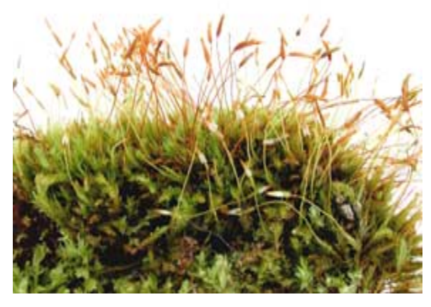
View of Tetraphis pellucida which grows on well-decayed stumps and logs. This moss has 4-parted capsules, which is unique among the mosses.