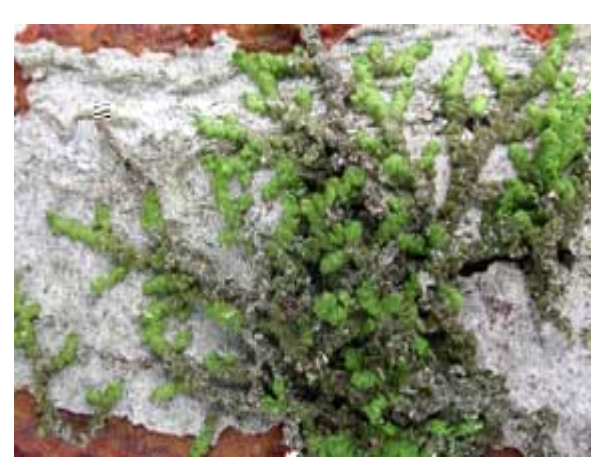
Top view of Frullania sp. , and bottom closeup view of Frullania sp. showing the growth pattern on tree bark.

Top view of Diphyscium foliosum , and bottom closeup view of D. foliosum showing the female plant with its stalkless capsules that resemble a grain or nut surrounded by long hairs (leaves).