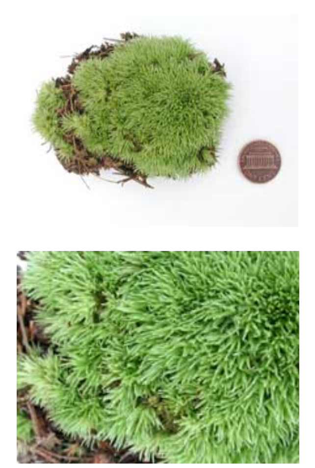
Top view of Leucobryum glaucum showing clustered growth pattern, and bottom closeup view of L. glaucum showing the whitish leaves (leaves have several layers of colorless cells which hide the color of the chlorophyll).