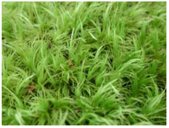
Top view of Dicranum scoparium , and bottom closeup view of D. scoparium showing the broom swept appearance of the foliage.