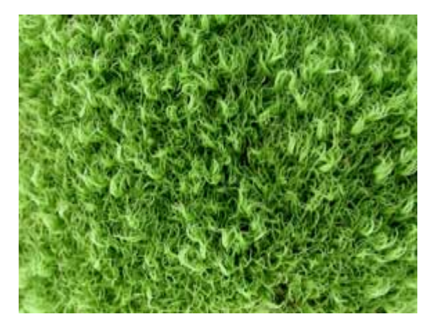
Top view of Dicranum montanum and bottom closeup view of D. montanum showing cork screw shape of leaves.