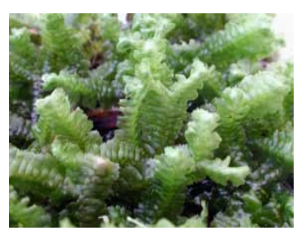
Top view of Bazzania trilobata and bottom closeup view of B. trilobata .