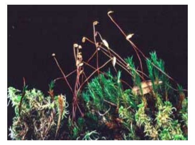
Top view of Polytrichium juniperinum and bottom view of P. juniperinum showing the capsules.