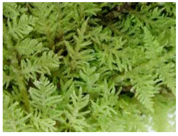
Top view of Thuidium delicatulum showing fern-like appearance of leaves, and bottom closeup view of T. delicatulum .