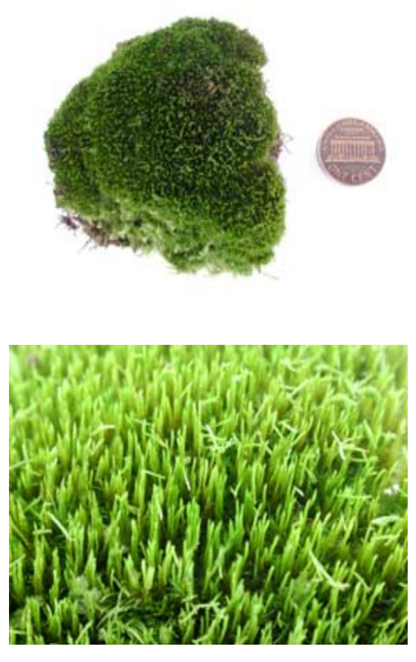
Top view of Qt y qf icranum xkt kf g, and bottom closeup view of Q. xkt kf g.